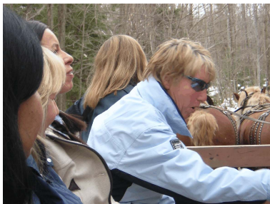
Fulton's Pancake House & Sugar Bush Pakenham, Ontario April, 2004